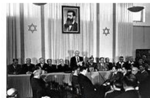
David Ben-Gurion, the first Prime Minister of Israel, pronounces the Declaration of the State of Israel at the Tel Aviv Museum of Art on May 14, 1948. Above him is a portrait of Theodor Herzl, the father of modern political Zionism.

In November of 1947, the United Nations adopted the Partition Plan for Palestine , which soon thereafter led to the establishment of modern Israel when the Declaration of the Establishment of the State of Israel was approved on May 14, 1948. Seventy full years